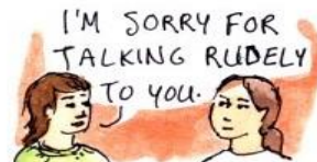
Answer to Word Find: Saint Helen The forgave him. Answer to puzzle on front:

Has anyone ever done something mean to you? How do you feel when that happens? Do you feel loving toward that person? Jesus tells us that we must forgive those people, even when they really hurt us, because we want God to forgive us too. Every time we sin we offend God, and He will still forgive us if we are sorry. If we want God to forgive us, then it's only fair for us to forgive others.