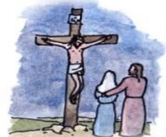
This Tuesday we celebrate the feast of the Exaltation of the Holy Cross. Try to find all the words in CAPITALS in the puzzle. Use the leftover letters to fill in the blanks at the end.

H S C F A T H E R T I C A R R Y A I S H L R L N A D A M A R L O V E D P L A C E J S A V I O U R R E E S R E V E R Y I T S K Y H E A V Y F W U H H E A V E N I O S K U L L I F E C O I F E L L E D I E D N L E T O R T U R E S O F F E R E D N N