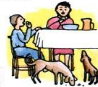
Dot to dot: dogs. Fill-in-the-blanks: just, revealed, Lord, servants, keep, sabbath, mountain, prayer, altar, house.

Jesus wasn't trying to make the woman give up. He was giving her a chance to show how much humility and faith she had. Jesus used this to show the people that God will let anyone who believes, like this woman, become part of His chosen people.